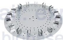
Cat. No.: 18900161 Type 2 plate 16*15ml centrifuge tube