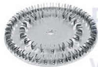
Cat. No.: 18900160 Type 1 plate 60*1.5ml centrifuge tube

Accessories for MX-RD-Pro: (Only 18900162 is standard accessory)