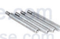
Cat. No.: 18900140 Plate support rods 4pcs in a group, use with plates